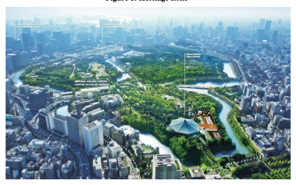
Figure 1: Heritage Zone<sup>2</sup>

Tokyo transport infrastructure is considered to be well-developed, with 1,052 km of railway tracks handling an average of 25.7 million trips (with a further 2 million trips handled by buses). Train headways of 2 minutes during rush hour are one of the world's shortest. There is some planned infrastructure investment which will contribute to the Games, with 20 km of major urban arterial routes to be widened, one train station to be expanded and 28 km of motorways and major urban arterial routes to be constructed. However this investment was planned irrespective of the Games bid, and Japan is unlikely to finance any additional major transport infrastructure specifically for the Games.