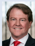
Donald F. McGahn II Washington Government Regulation +1.202.879.3939 dmcgahn@jonesday.com