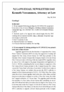
Template Used - Basic

69/rnavmap/distri/06dd99cc547a/clicked Bounces 4/rnavmap/distri/44fa-4bd3-97aa-06dd99cc547a/s Spam Reports 12/rnavmap/distri/06dd99cc547a/clicked Opt Outs