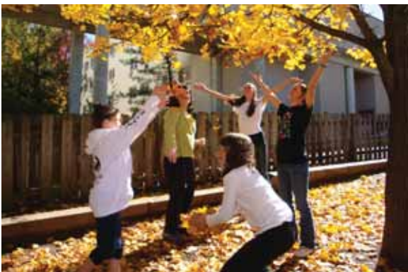
JUNIOR FRIENDS FALL FUN