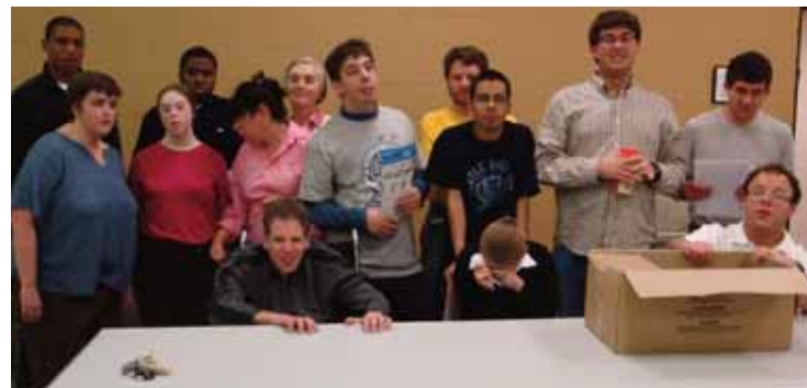
CIRCLE OF FRIENDS SEND A HOLIDAY PACKAGE TO TROOPS IN IRAQ