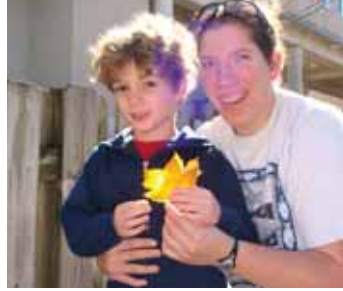
VOLUNTEERS LENDING A HAND AND A HEART