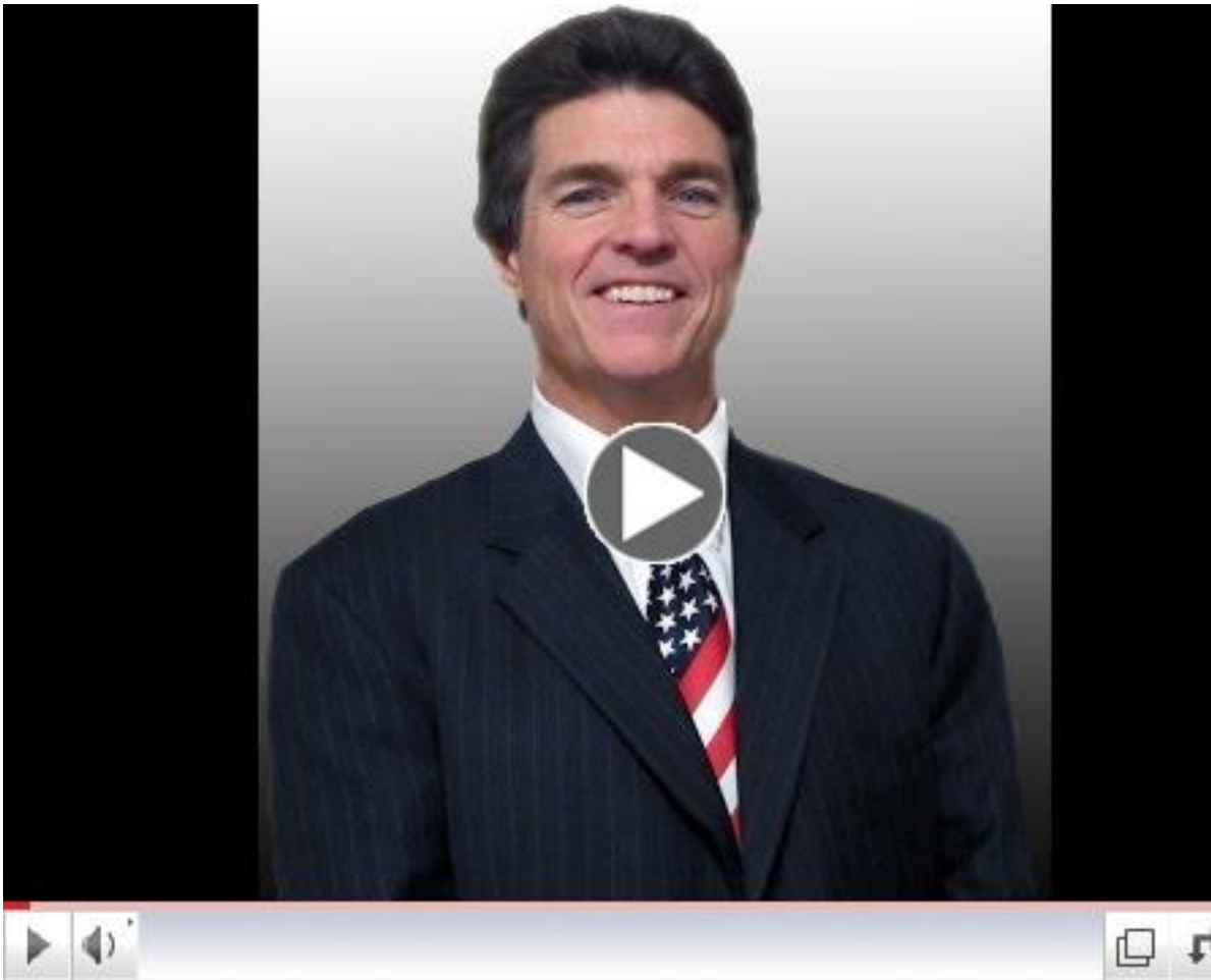
Sale of house in a probate case