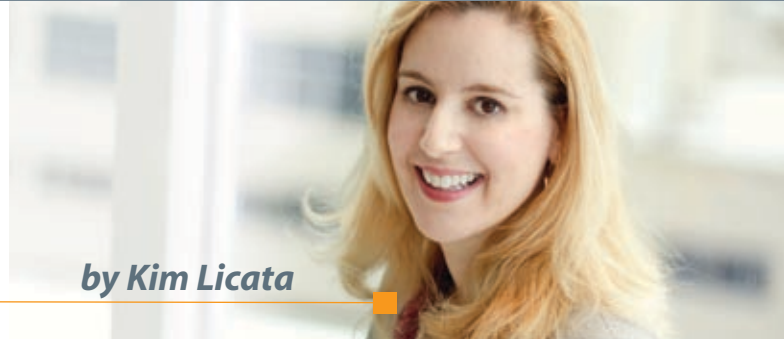
by Kim Licata

What else does CMS think a facility ought to do? CMS states that covered facilities “effectively” implementing the EJA’s re-