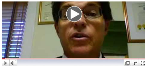
Driving while suspended defenses 39:3-40