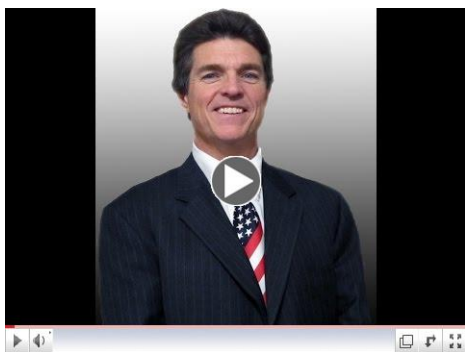
Objecting to consent forms in DWI blood cases