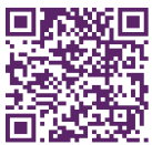
K&L Gates' Guide To Political and Lobbying Activities

More than 20 years ago, K&L Gates published the first edition of "A Guide to Political and Lobbying Activities," designed to simplify political law compliance for the busy Washington professional.