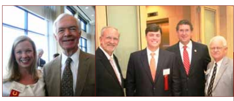
Caroline Sims and Senator Thad Cochran

Butler Snow hosted the Madison County Business League in our conference center for its "Coffee with the Senator" series with special guest U.S. Senator Thad Cochran. Senator Cochran addressed issues related to the federal budget and appropriations process as well as measures for job creation and deficit reduction. In addition to Senator Cochran, Representative Gregg Harper (MS-3) and many local elected officials were in attendance for the breakfast.