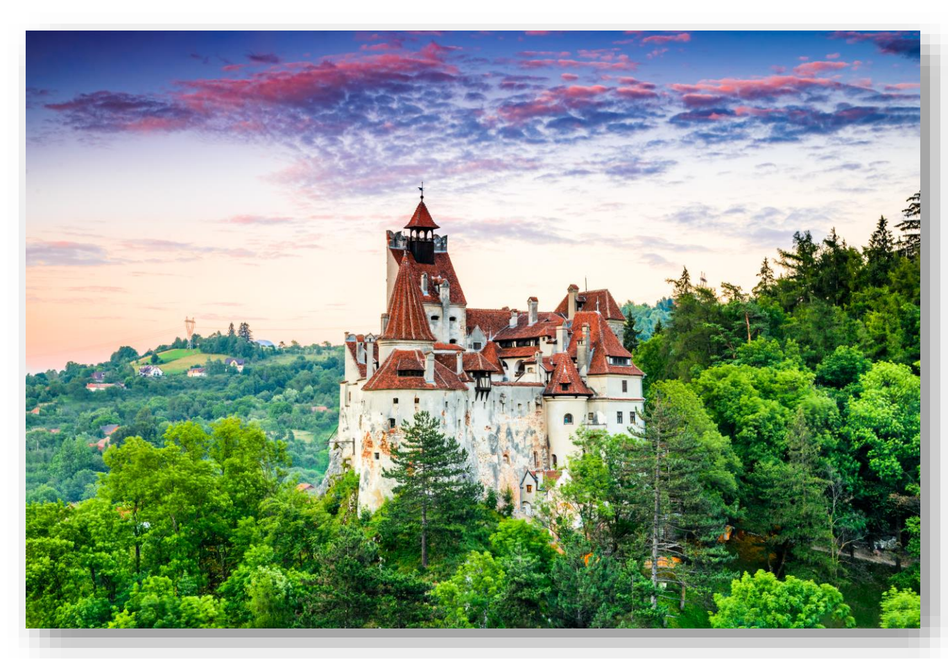
PETERKA & PARTNERS Buying and Selling Real Estate in Romania