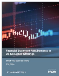
Financial Statement Requirements in US Securities Offerings: What You Need to Know