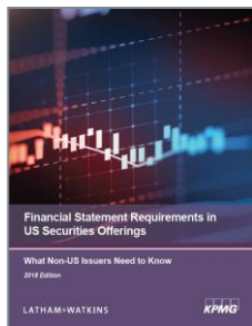
Financial Statement Requirements in US Securities Offerings: What Non-US Issuers Need to Know