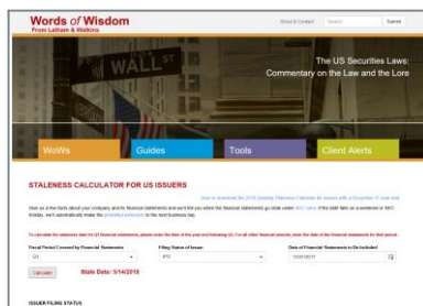
Words of Wisdom Online Staleness Calculator

Latham & Watkins resources offering definitions and explanations in plain English: