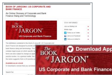
Book of Jargon®: US Corporate and Bank Finance Blog and App