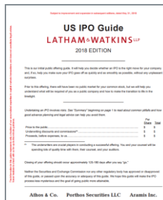
The Latham & Watkins US IPO Guide